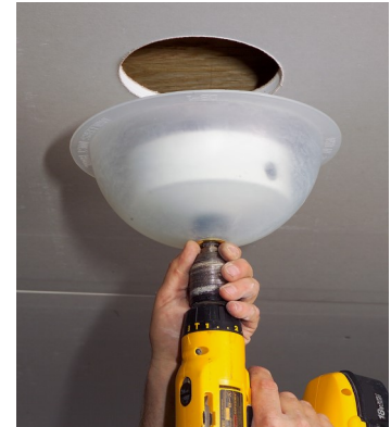
DRILLER'S DUST BOWL This tool catches debris by forming a seal with the ceiling while not leaving marks on the ceiling